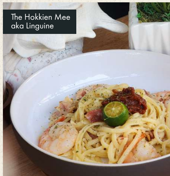
The Hokkien Mee aka Linguine

Marinated overnight beef steak with Mexican Seasoning, Veges, Guac, Sour Cream, Soft Fluffy Tortilla